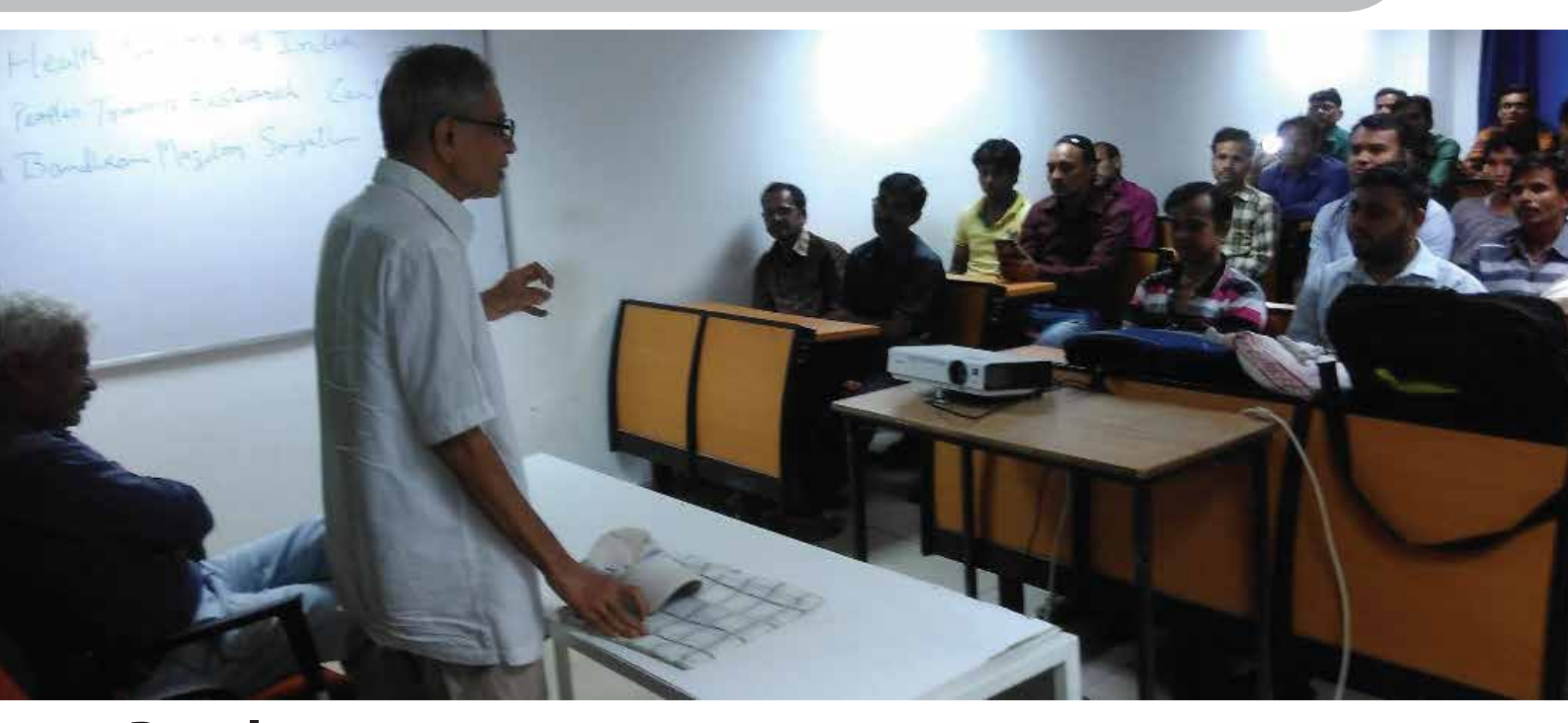
Peoples Training & Research Centre (PTRC) organized one day OSH training for painters and carpenters in collaboration with Bandhkam Mazdur Sangathan (Construction Workers Union) at Ahmedabad on 11 August. Find more ... http://peoplestraining.org/