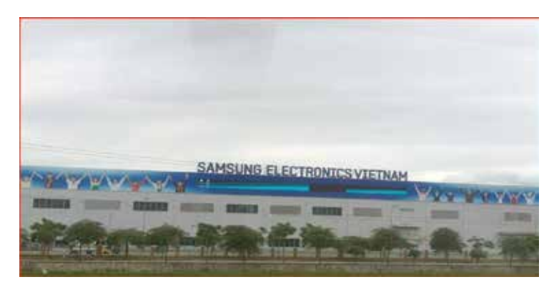
Read more.... https://goodelectronics.org/stories-women-workers-vietnams-ele ctronics-industry/

as electronics exports outpace other exports. Samsung alone has over 100,000 workers, who produce approximately 50% of all Samsung phones. However, Vietnam has no labor codes specifically protecting the health of electronics industry workers, who are overwhelmingly women.