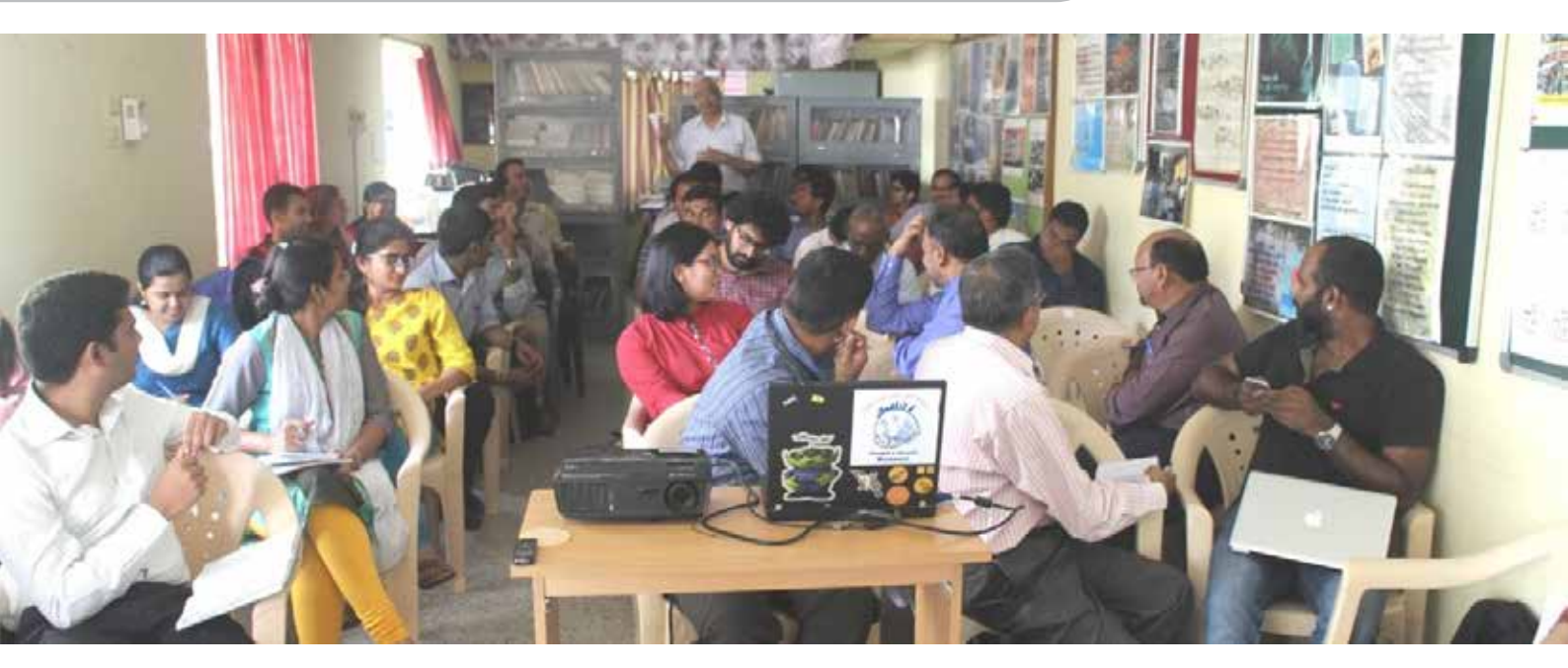
OEHNI and PTRC organized one day workshop on asbestos at Chennai on 25 November.

More information ... http://peoplestraining.org/